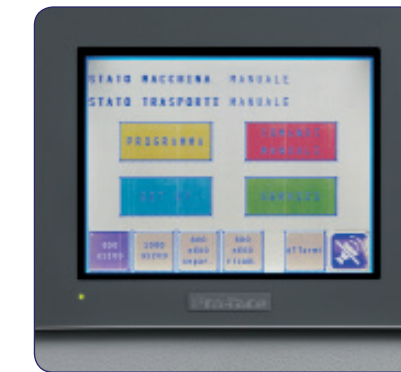
Control panel equipped in a standard version with a touch-screen operator Display.