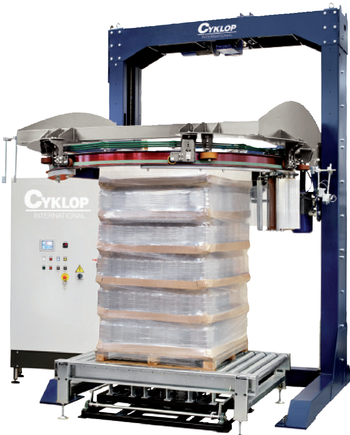
STRETCH WRAPPER MODEL: CSR TWIN