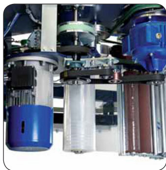
External pre-stretch dry system.